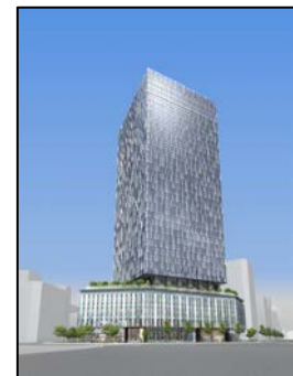
Dai Nagoya Building