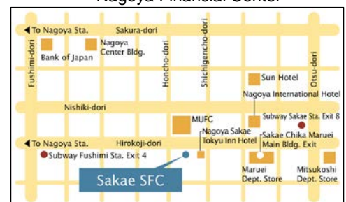
Sakae Financial Center